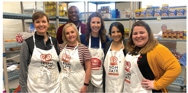
Explorer Pipeline employees volunteered for Iron Gate's grocery pantry in January, helping 58 families with groceries.