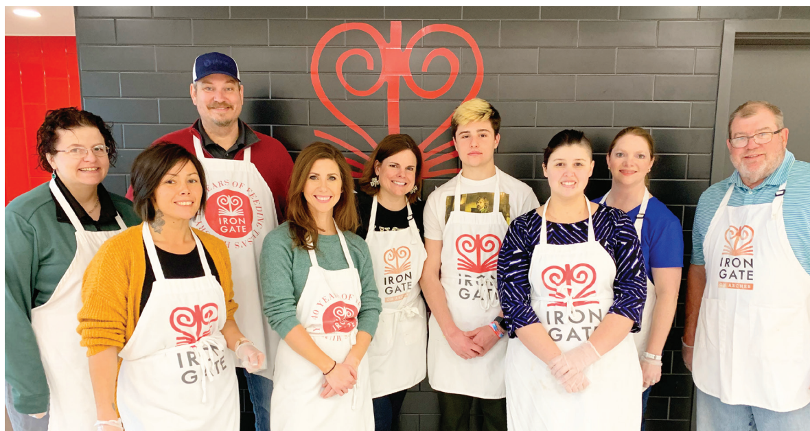
Iron Gate is an Explorer Pipeline Partner Agency. Not only did the company make a three-year financial commitment to feeding the hungry and volunteer to serve, but employees also participate in food drives to make sure those in need are fed.