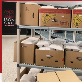
To-go meals packed to be delivered to the Overflow Shelter.