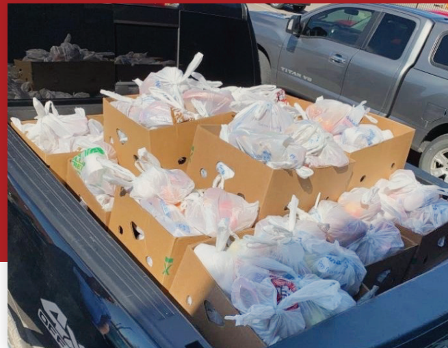
Outreach Bags loaded up in a truck at Iron Gate to be distributed to homeless across the city.