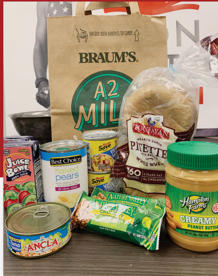
Grocery bags are filled with these items for Youth at Heart campers.