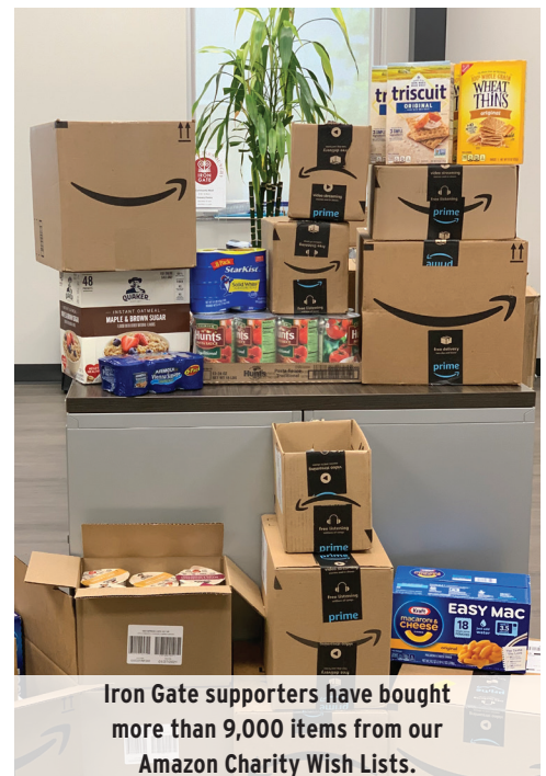
Iron Gate supporters have bought more than 9,000 items from our Amazon Charity Wish Lists.