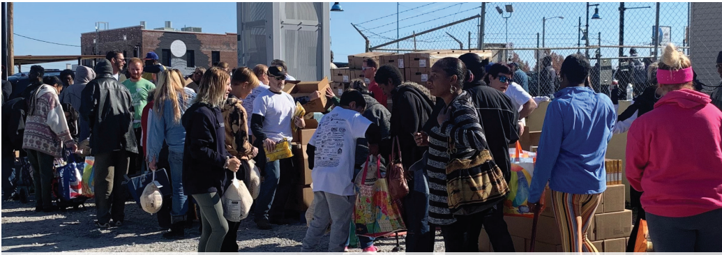
Lawyers Fighting Hunger and Iron Gate distributed 1,000 turkeys in 2019.